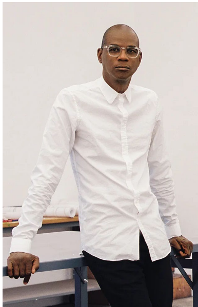
Mark Bradford b. 1961

Bradford creates "paintings" from layers of paper, rope, and glue (often sourced from Home Depot) that are ripped, torn, and pulled back to reveal emotive colors and visceral textures.